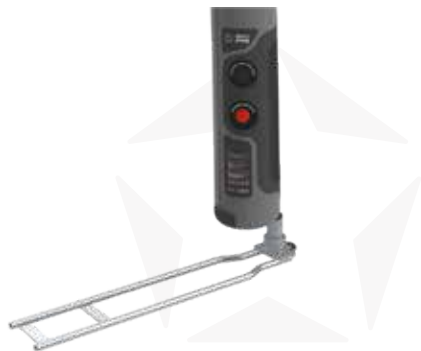
DRIVE-ON BASE WITH ROTATOR

STARX FLAGPOLES CAN BE USED ON VARIOUS SURFACES BY USING DIFFERENT BASES