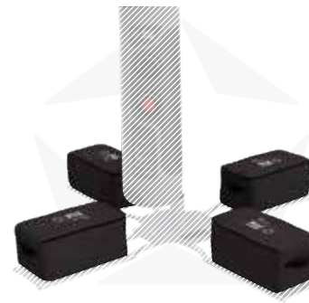
WEIGHTS FOR THE CROSS BASE

ROTATING BASE CAN BE USED IN ALL CONDITIONS, ESPECIALLY ON HARD SURFACES. IN WINDY CONDITIONS USE WITH ADDITIONAL WEIGHTS FILLED WITH SAND