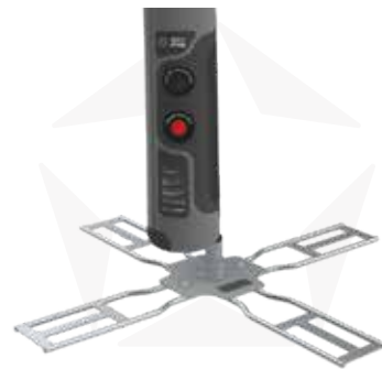
CROSS BASE WITH ROTATOR

DRIVE THE WHEEL OF THE VEHICLE ONTO THE BASE, TO OBTAIN A STABLE AND IMPRESSIVE FLAG DISPLAY