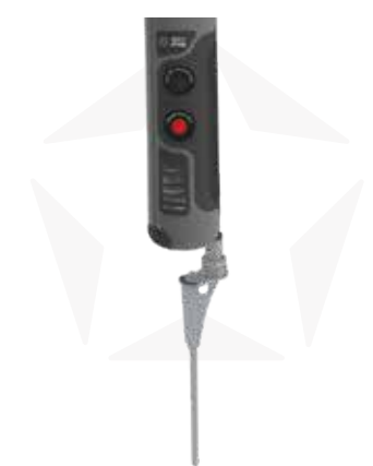
HAMMER BASE WITH ROTATOR

OPTIONAL SAND-FILLED WEIGHTS TO INCREASE THE STABILITY OF THE CROSS BASE. AVAILABLE IN DIFFERENT VARIANTS FOR EACH STARX FLAG MODEL.